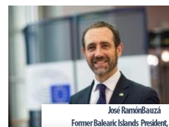
José Ramón Bauzá Former Balearic Islands President, MEP, TRAN Coordinator, Tourism Task Force Chair